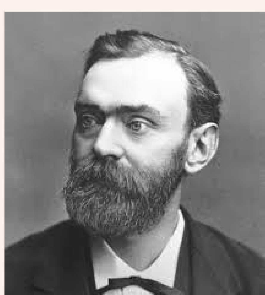
ALFRED NOBEL (1833 - 1896)

The Nobel Prizes are a result of the conditions laid down in one man's will?