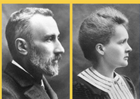
A fruitful collaboration