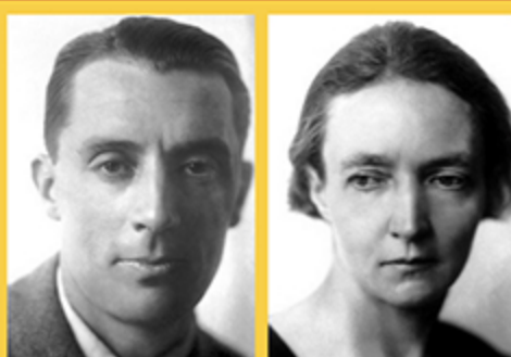
A scientific couple